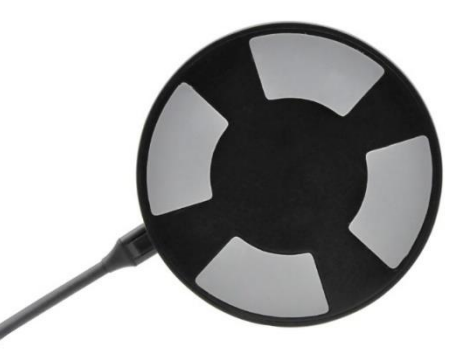
Figure 3: Microphone Array Back