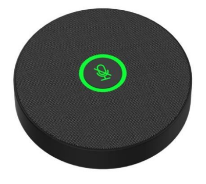
Figure 2: Microphone Array Front